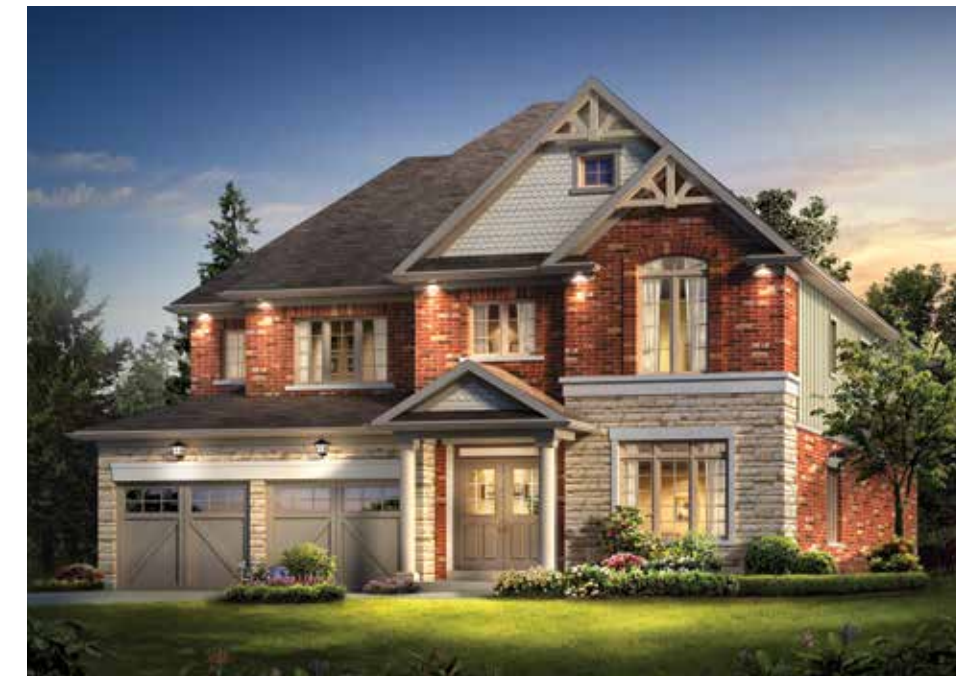
Elevation B • 3,078 sq.ft.